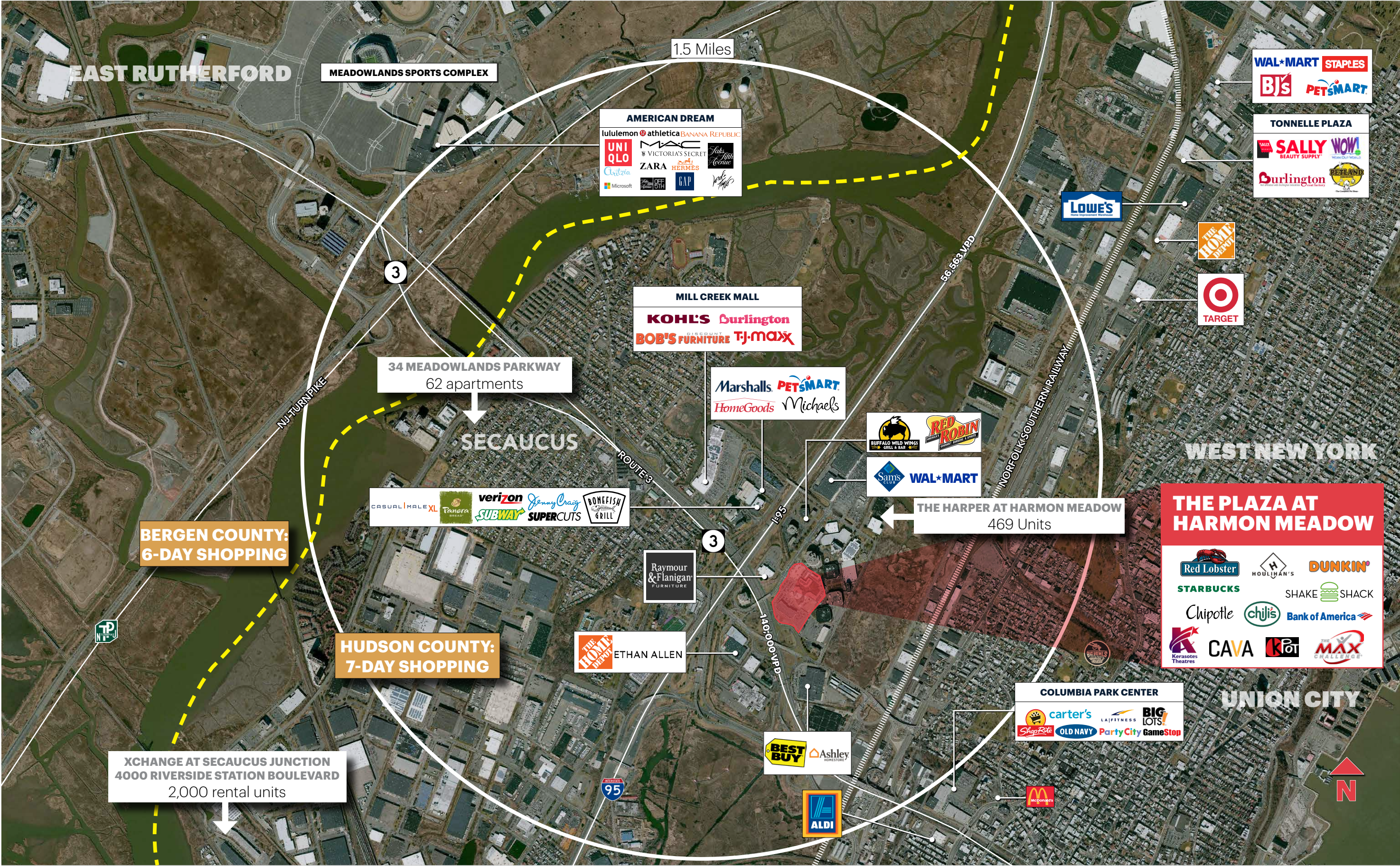
THE PLAZA AT HARMON MEADOW SECAUCUS, NJ