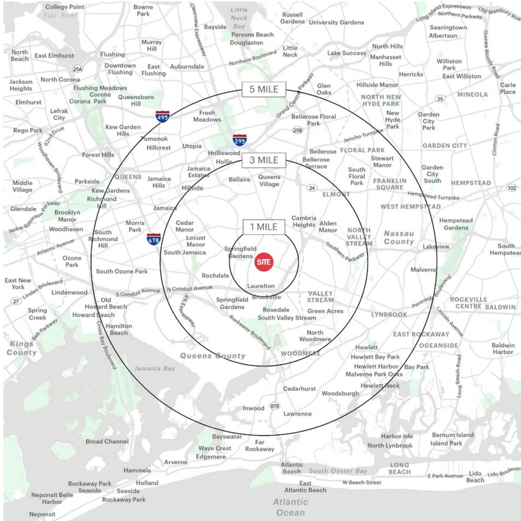
221-26 MERRICK BOULEVARD QUEENS VILLAGE, NEW YORK