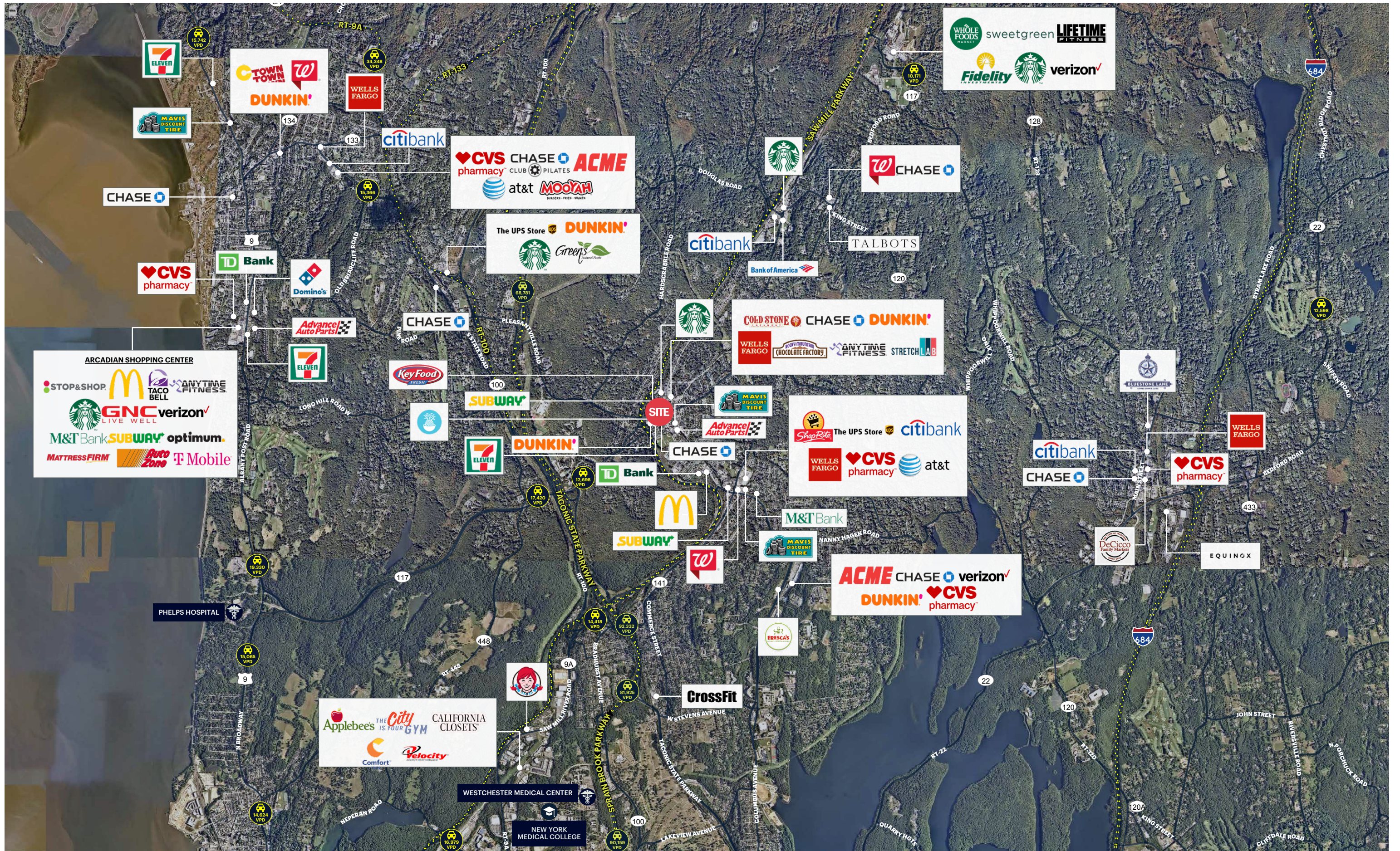
PLEASANTVILLE LOFTS 70 MEMORIAL PLAZA PLEASANTVILLE, NEW YORK