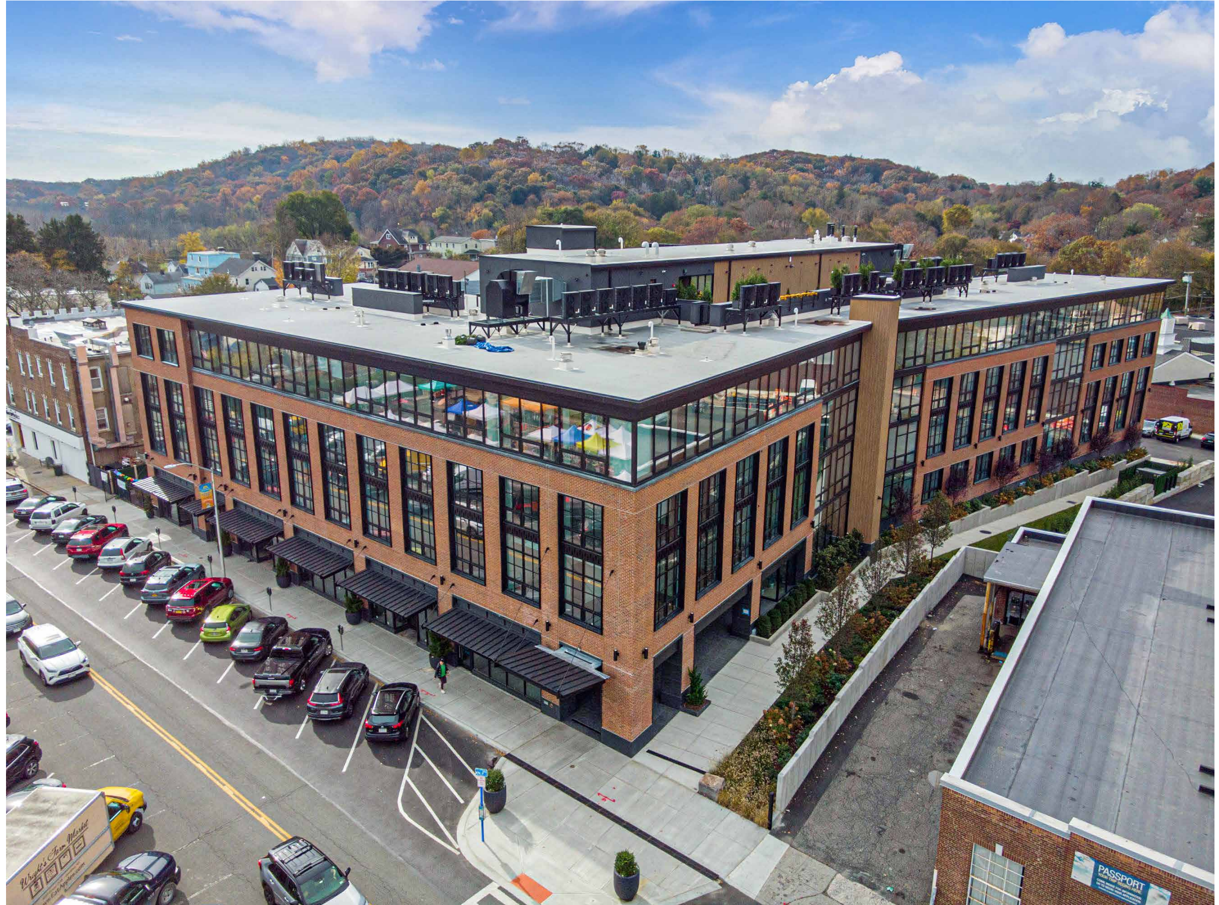
PLEASANTVILLE LOFTS 70 MEMORIAL PLAZA PLEASANTVILLE, NEW YORK