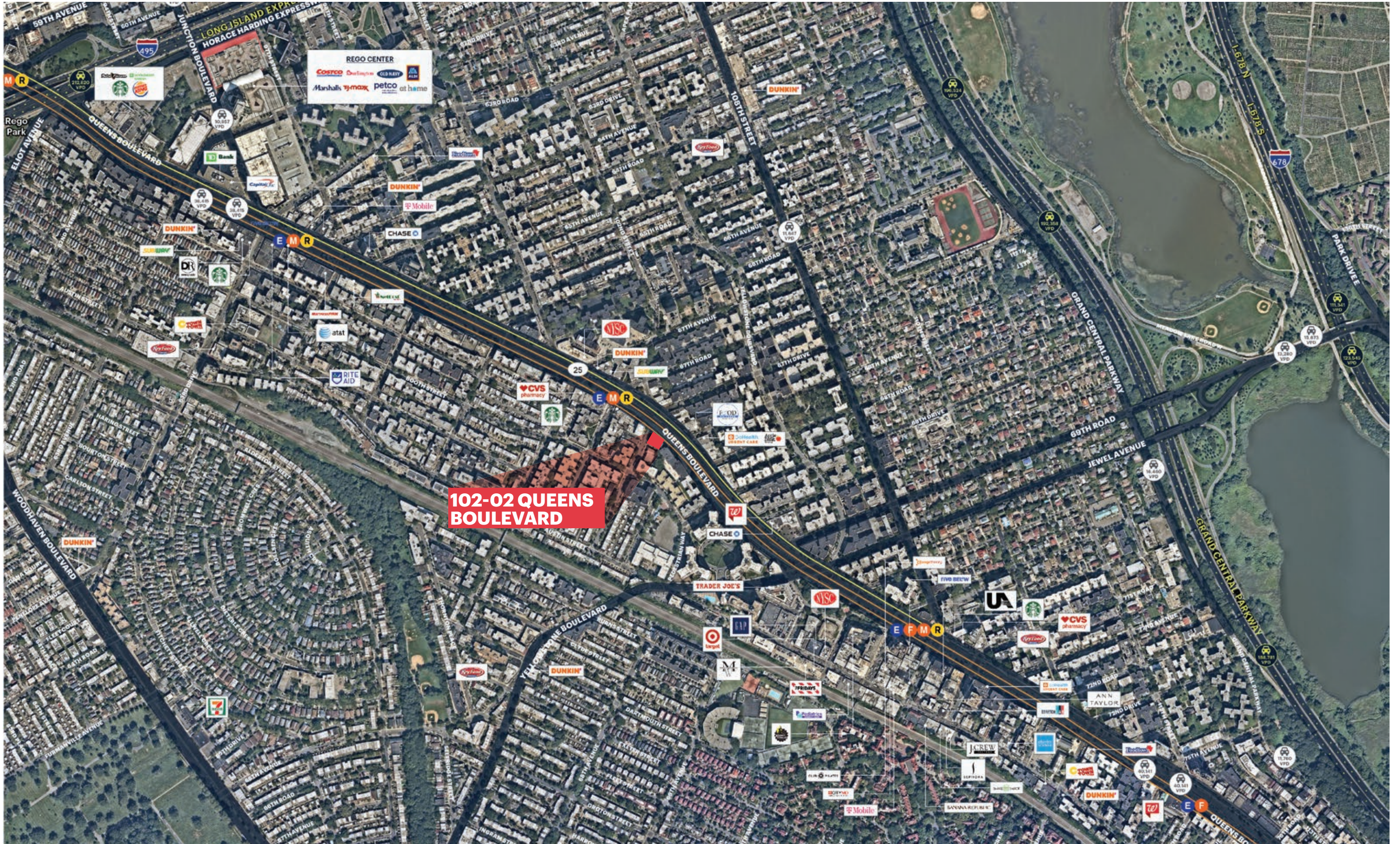
102-02 QUEENS BOULEVARD FOREST HILLS, NEW YORK