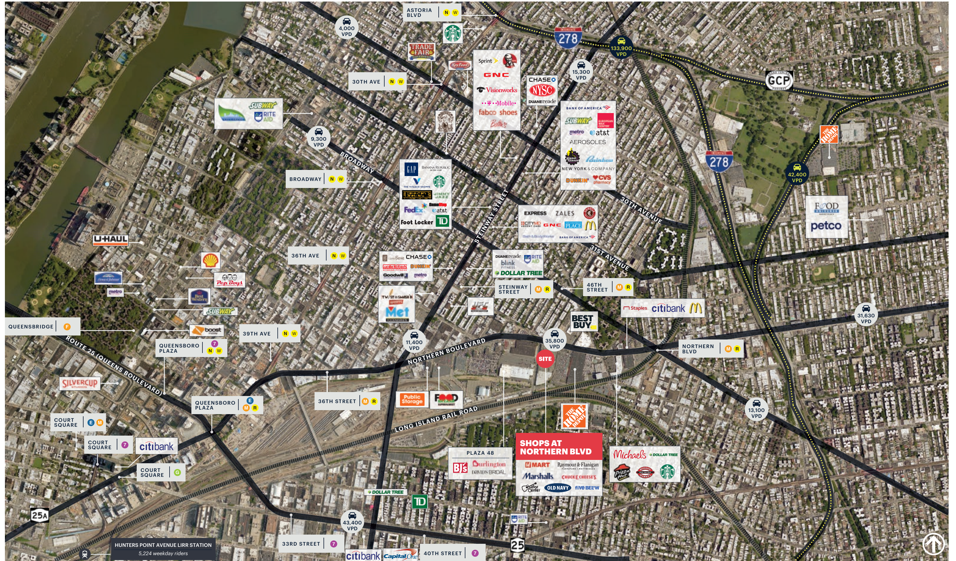
SHOPS AT NORTHERN BOULEVARD LONG ISLAND CITY, NEW YORK