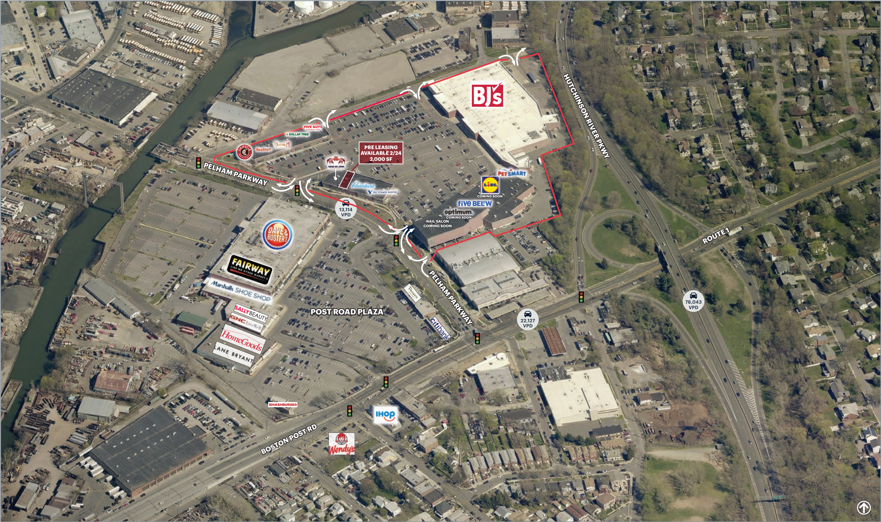
PELHAM MANOR SHOPPING PLAZA PELHAM MANOR, NEW YORK