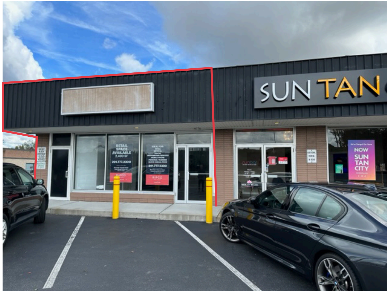
2,400 SF SPACE