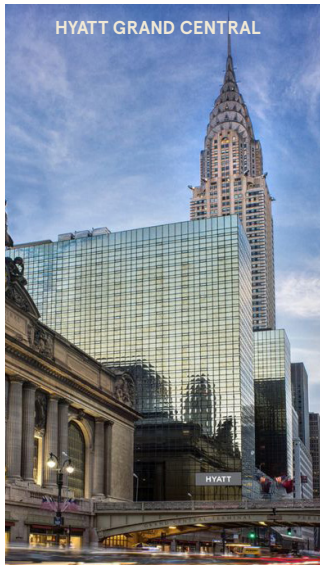
HYATT GRAND CENTRAL