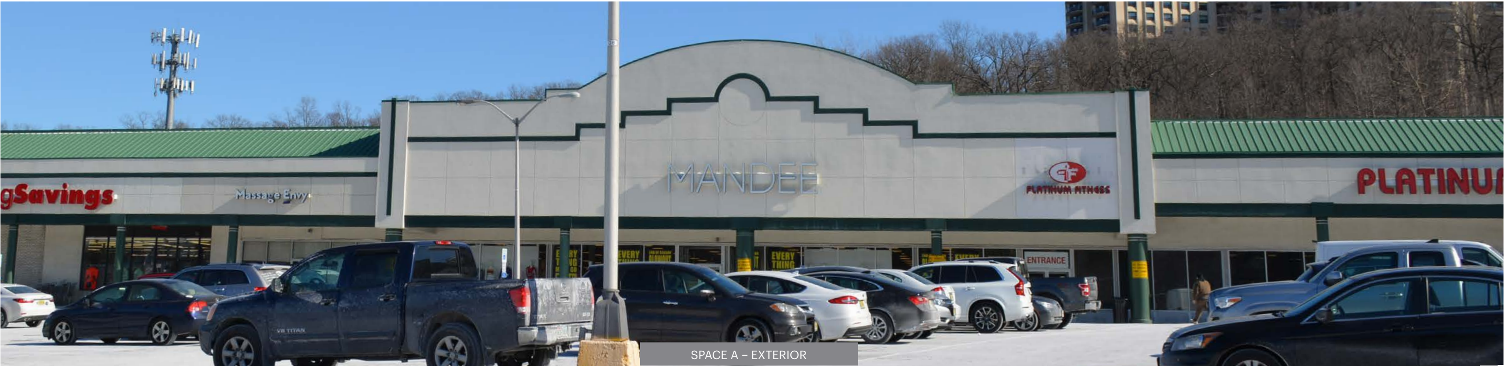
SPACE A – EXTERIOR