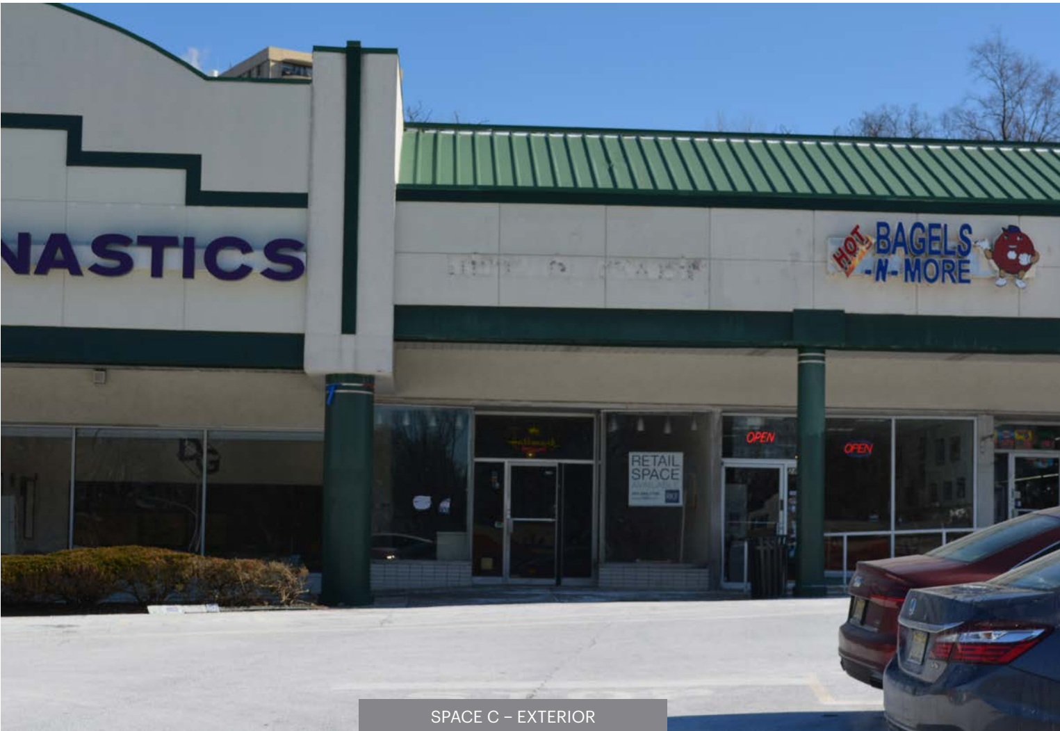
SPACE C – EXTERIOR