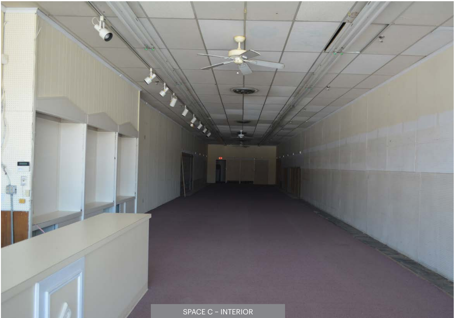
SPACE C – INTERIOR