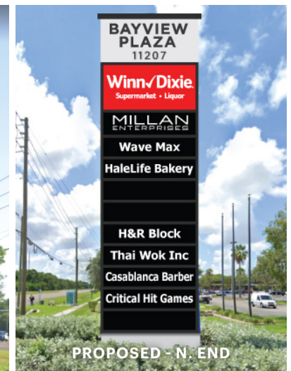
PROPOSED - N. END