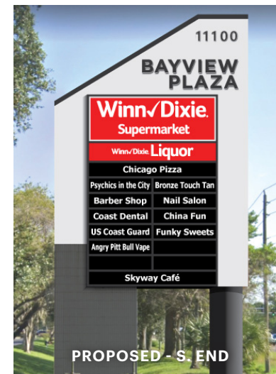
PROPOSED - S. END