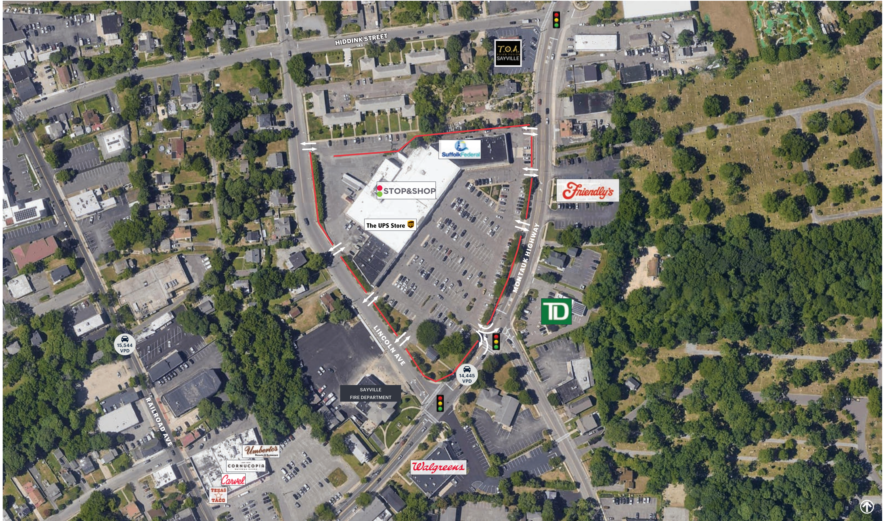
STOP & SHOP PLAZA SAYVILLE, NEW YORK