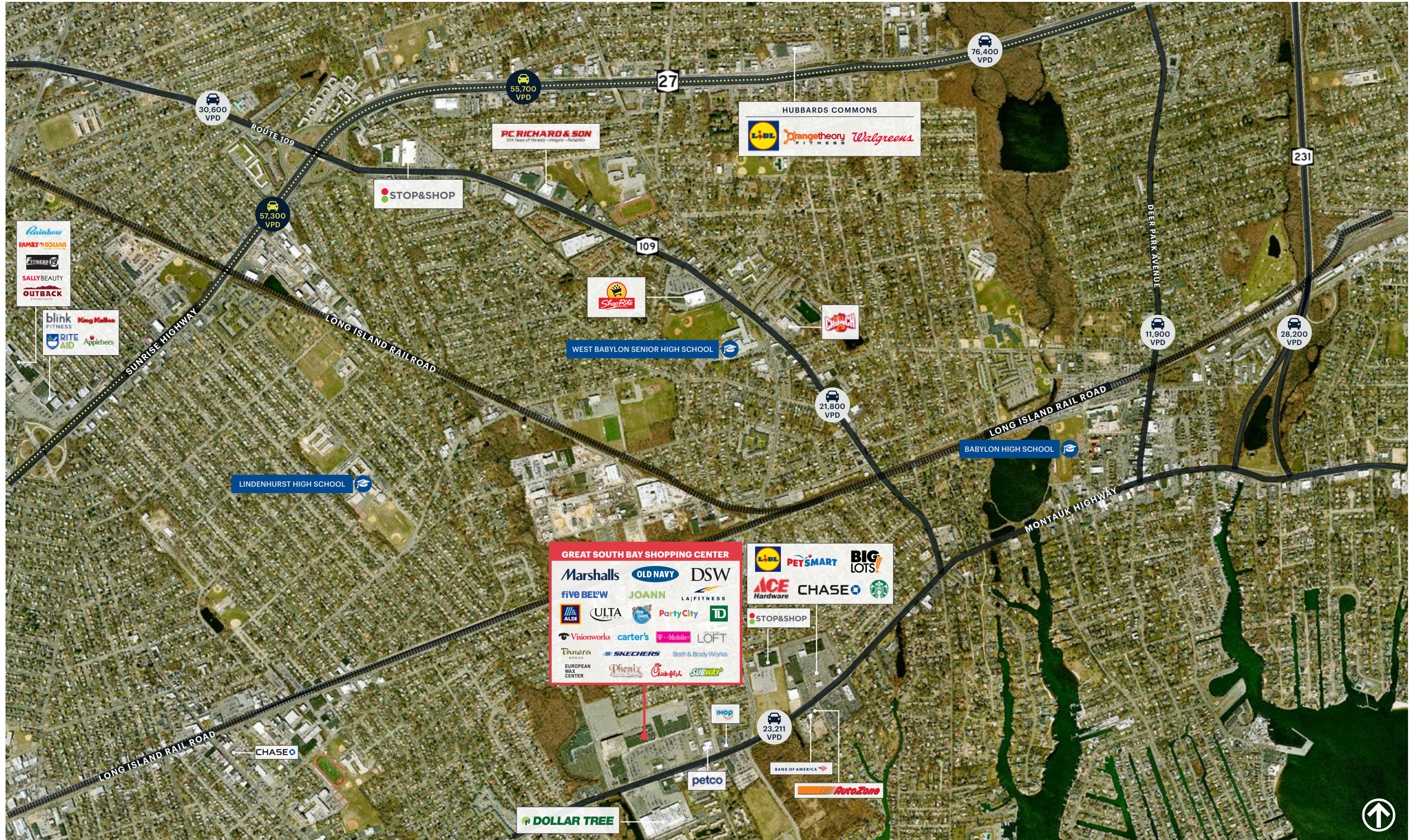
GREAT SOUTH BAY SHOPPING CENTER WEST BABYLON, NEW YORK