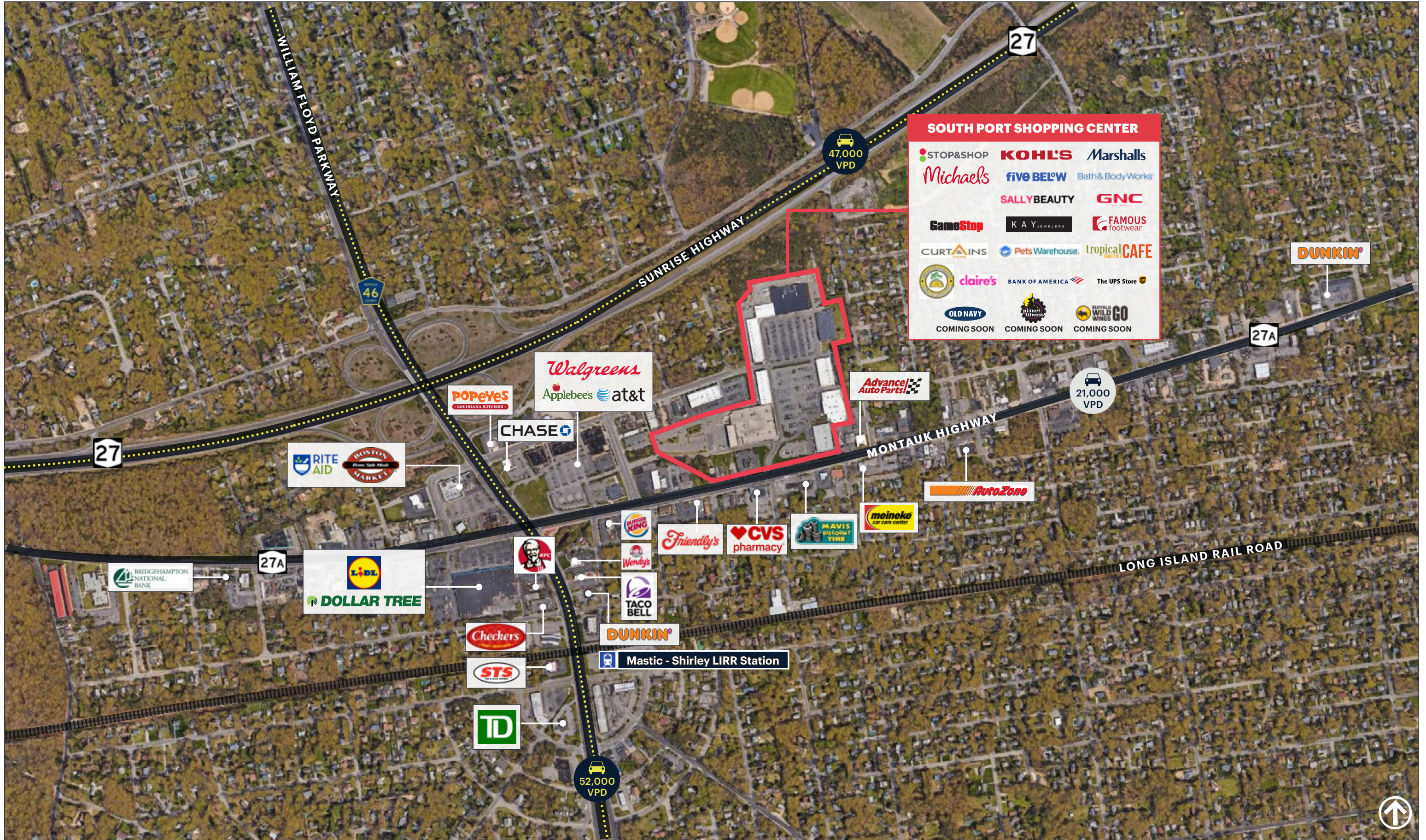
SOUTH PORT SHOPPING CENTER SHIRLEY, NEW YORK