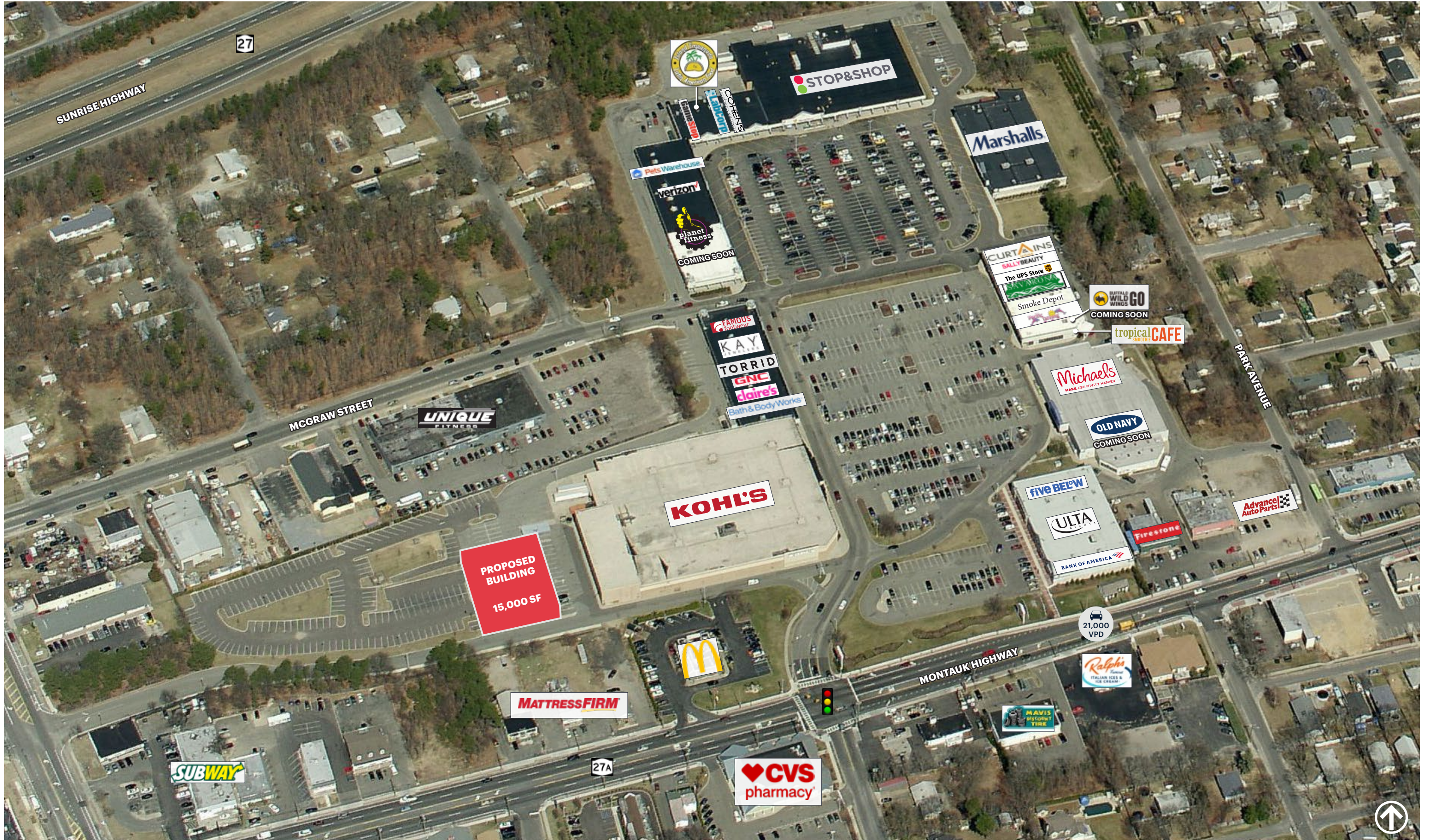
SOUTH PORT SHOPPING CENTER SHIRLEY, NEW YORK